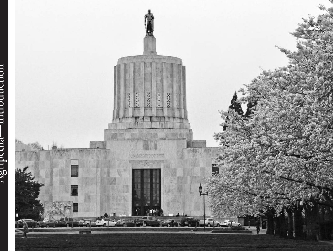
Cherry blossoms at the Oregon State Capitol in Salem.