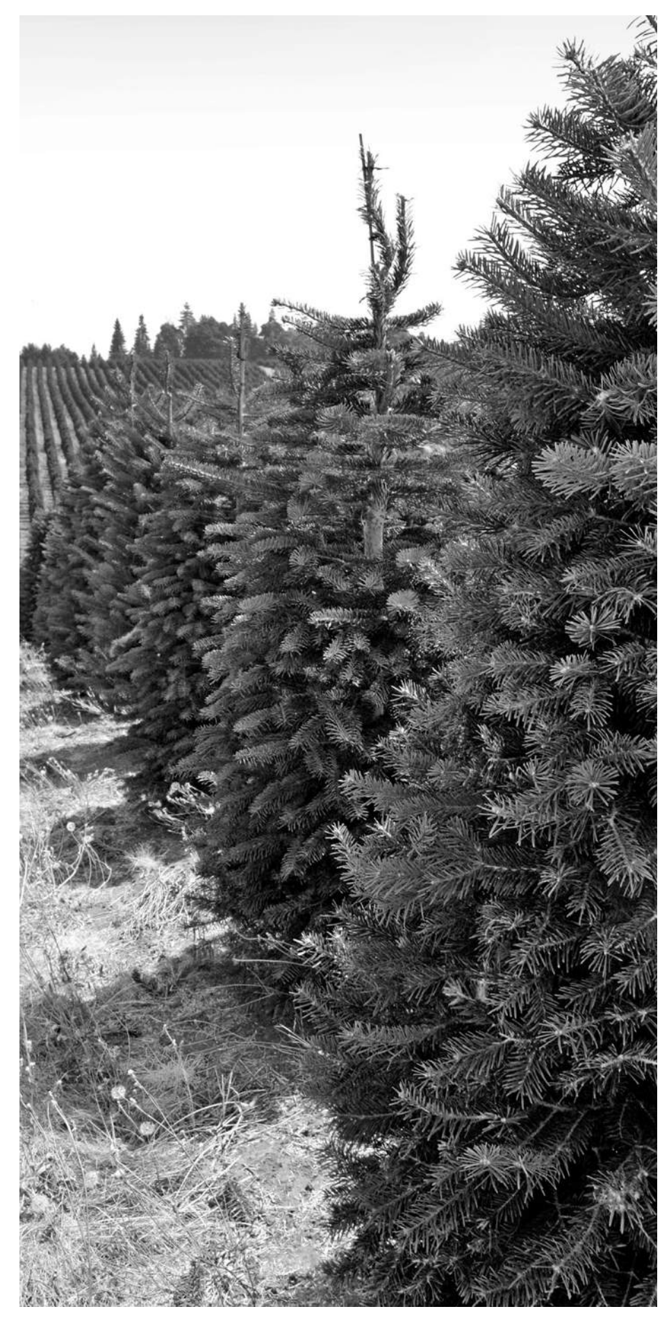
Christmas trees in Silverton, Oregon.