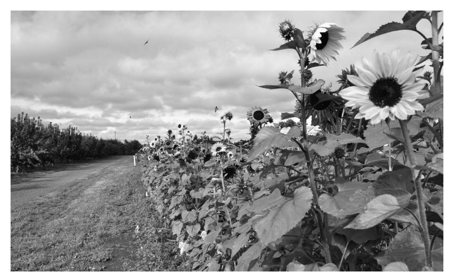
Sunflower field in bloom.