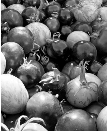
Fresh picked tomatoes.