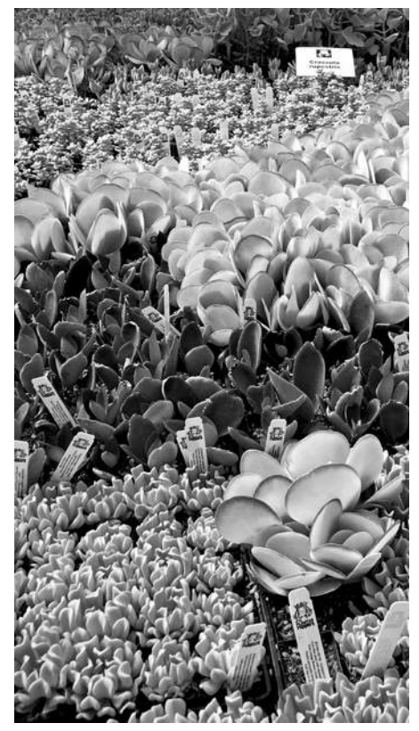
Succulents at an Oregon nursery.