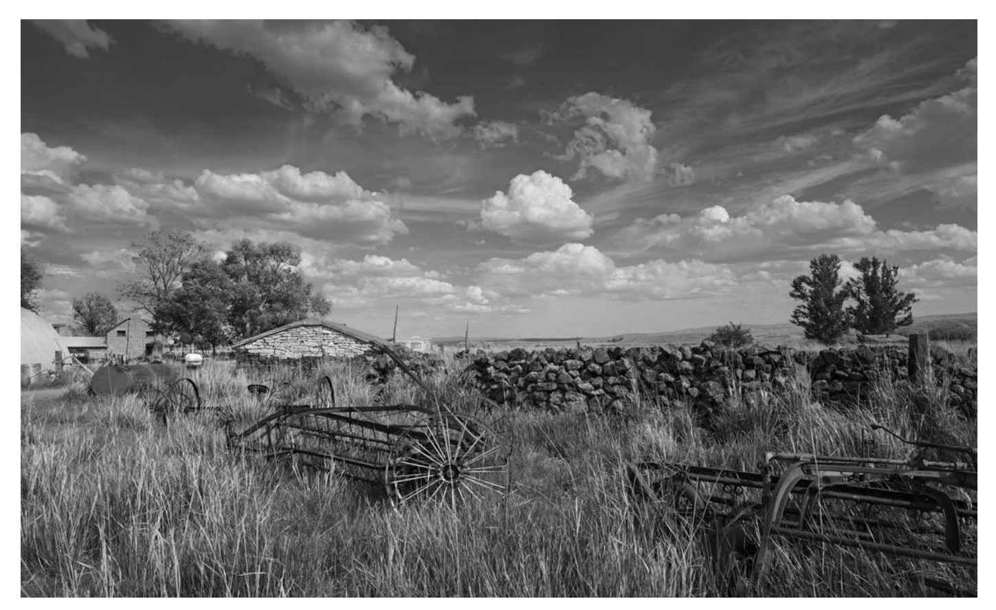
Eiguren Brothers Farm in Jordan Valley, Oregon.