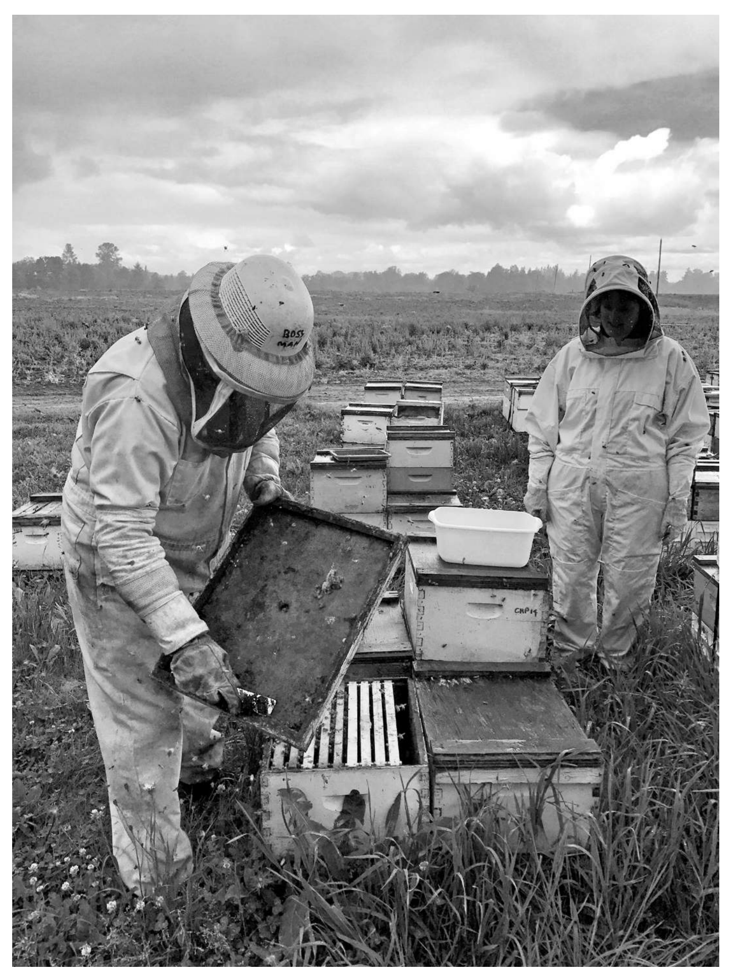
National honey bee health survey.