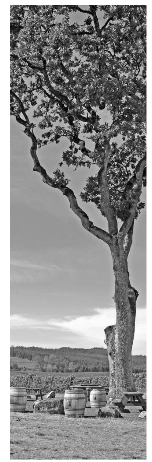
Firesteed Winery estate vineyard in Rickreall, Oregon.

Web _____ chemeketa.edu/programs/ winestudies