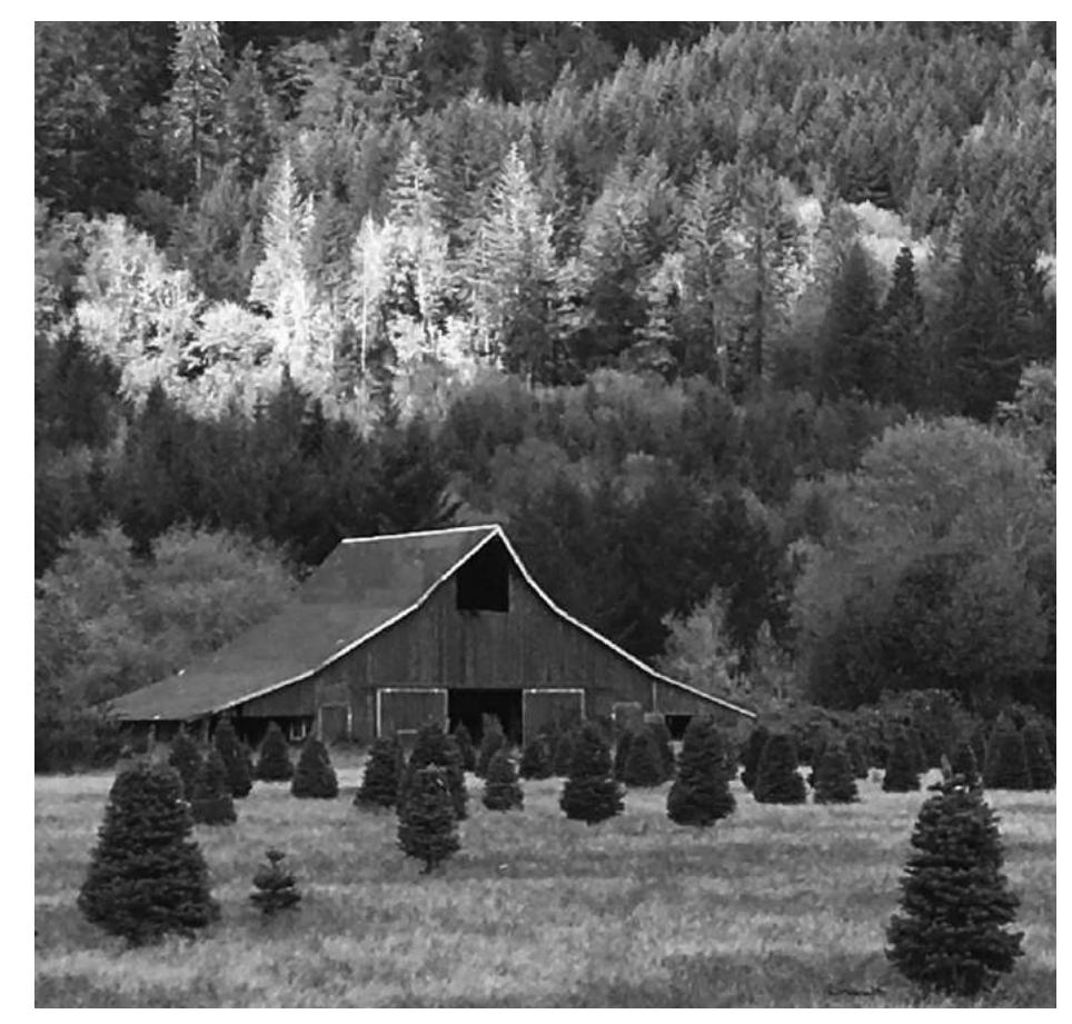
Christmas trees.